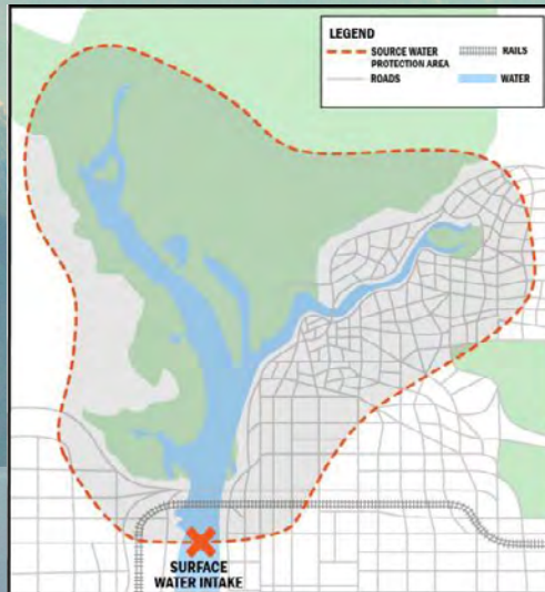
Figure 2 Example of a source water protection area

A source water protection area is the land upstream of a surface water intake, or within the recharge zone of a drinking water well, that is most likely to influence the quality of source water (ANSI/AWWA G300, under revision). The size of the area can vary significantly on the basis of physical, environmental, and regulatory considerations. The 1996 SDWA Amendments required delineation of source water protection areas for each water system. Some systems may have updated their delineations since the original assessments were completed. Figure 2 shows an example of a source water protection area.